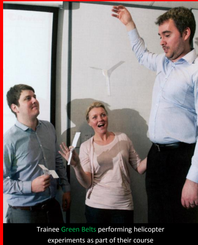
Trainee Green Belts performing helicopter experiments as part of their course

"Revive quickly integrated into our team and worked with pace and tenacity to deliver immediate and demonstrable results using their unique practical take on Lean Sigma Methodology." MD, Keltbray