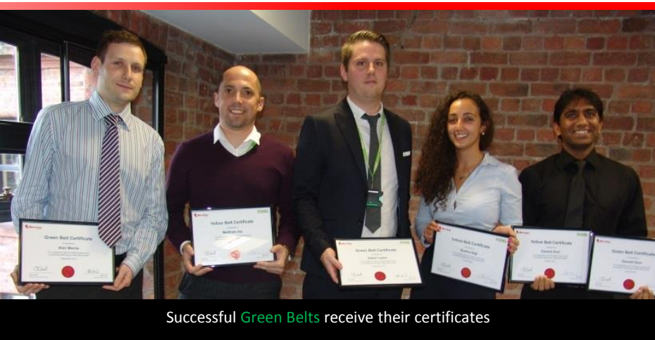
Successful Green Belts receive their certificates

"With squeezed margins and raised customer expectations causing unprecedented demands on our teams, the need to apply a formal methodical framework for process improvement has never been so critical."